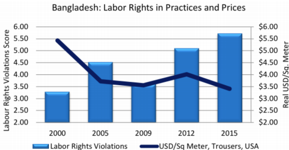
Figure 2: Bangladesh: Labour Rights in Practices and Prices